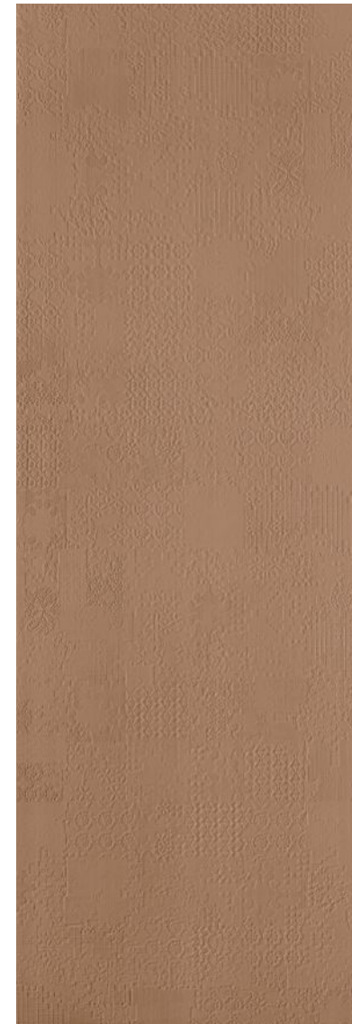
Déchirer XL Avana 100-300 cm * 39"-118"