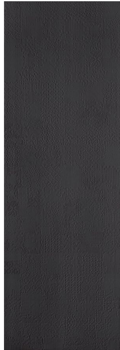
Déchirer XL Grafite 100-300 cm * 39"-118"