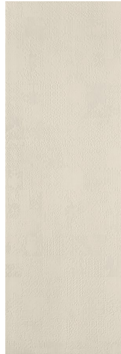
Déchirer XL Gesso 100-300 cm * 39"-118"